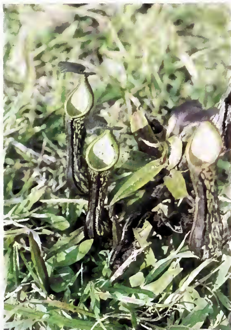
N. sp. 'New Species' From G. Pangulubao